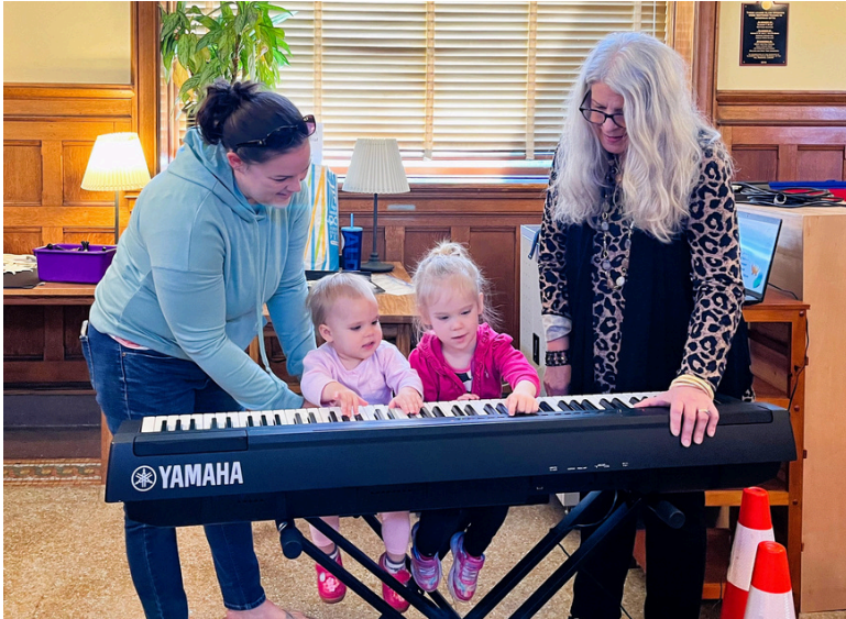
Touch a Piano Day at Music and Movement

Children's programming was very active (and interactive) this past year! Several children completed our 1000 Books Before Kindergarten program and are featured in our Children's Room. The continuation program, 500 Books Before Middle School, is taking off, with many school-age kids signing up and participating. We made use of our beautiful outdoor space for weekly Storytimes, popular Sing-Alongs with live music, and Summer Reading programs.