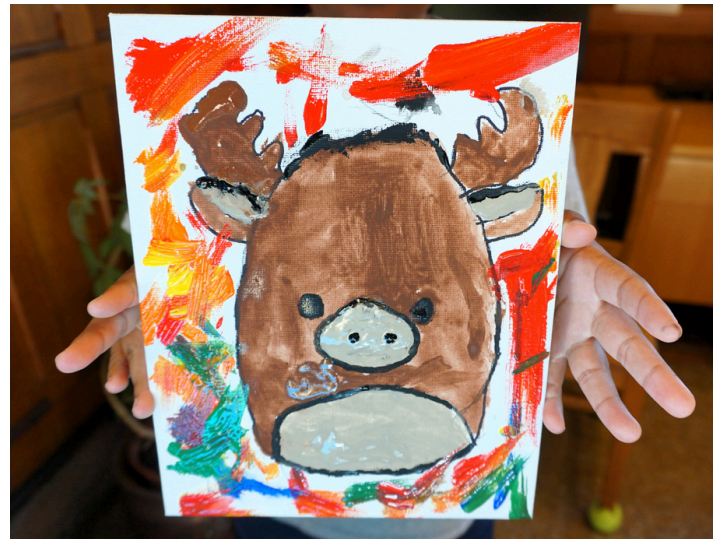
Summer painting program