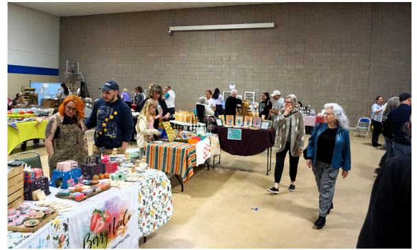
April Indoor Artisan Market

We get by with a lot of help from our Friends! The Friends of the Bill Memorial Library is made up of dedicated volunteers who are integral to the success of many library events, including Summer Fun programs. The Friends host several events of their own as well, including the Artisan Market, and collaborate with local libraries for activities like Edible Books. We thank them for their many years of hard work and amazing programs!