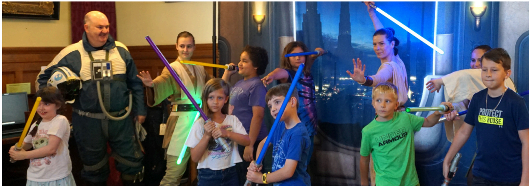
Saber Guild Kessel Temple Padawan Training

We are grateful for the talent and energy that our volunteers generously donated to the Library. Many hours were spent on maintenance projects, fundraisers and programming that enriched the Library's services to our community. Thank you!