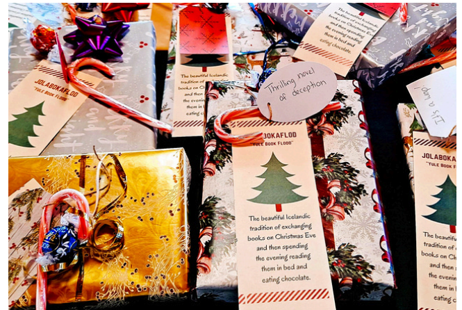
Jolabokaflod wrapped books