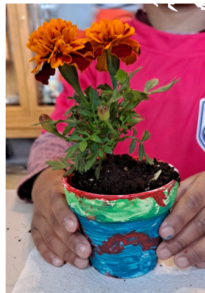
Marigolds for Mom masterpiece