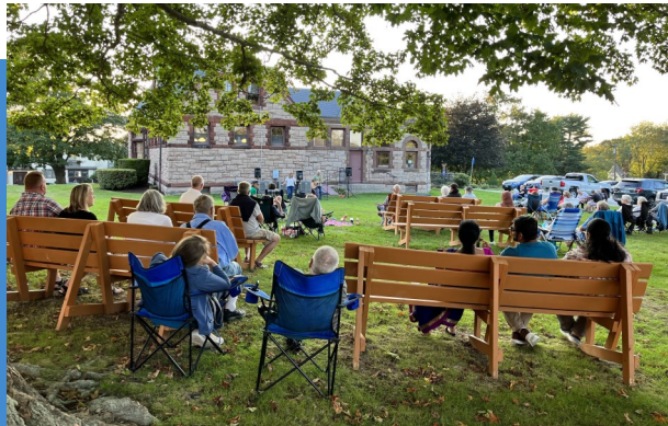
Crowd enjoying music performed by Azalea Drive at Friends Night Out