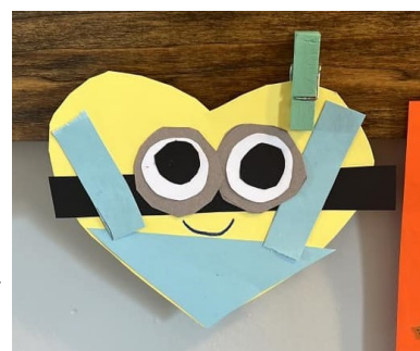
Heart Take & Make