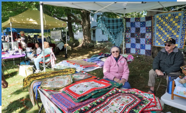
Vendors at the annual Artisan Market