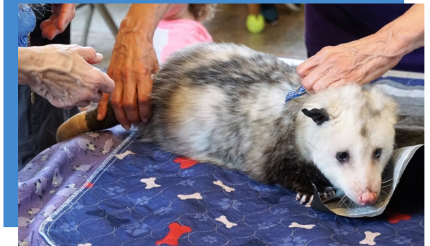
Mango the Opossum of Ferncroft Wildlife Rescue