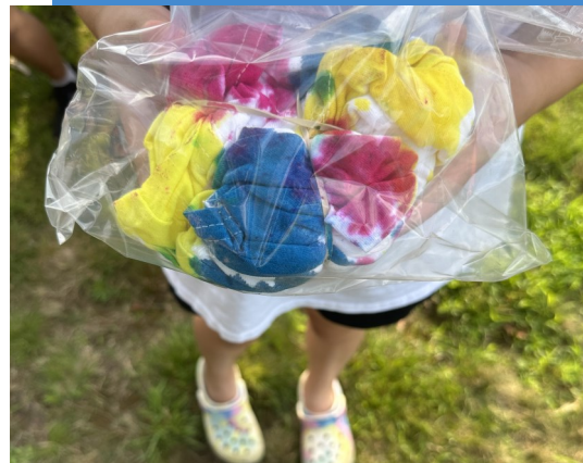
Above: Tie-dyed t-shirts

We also offered the Girls Who Code program to middle and high school girls, which aims to make technology a more inclusive career. Coders worked independently to learn coding languages, made crafts that combined STEM and art, and problem-solved together.