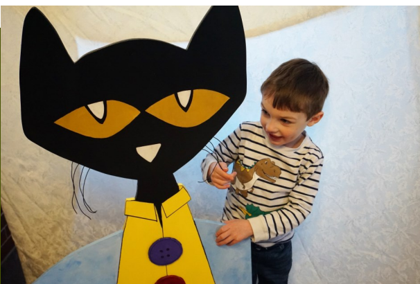
Celebrating Pete the Cat on Take Your Child to the Library Day