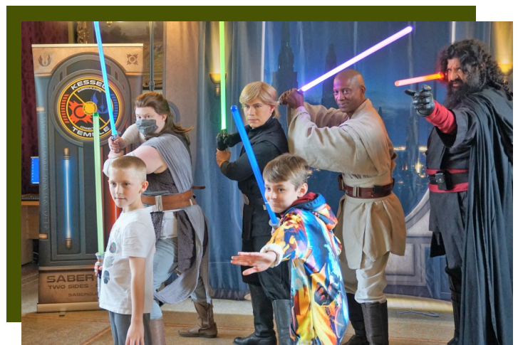
The Jedi of Kessel Temple taught younglings the basics of using the Force and how to wield a lightsaber!