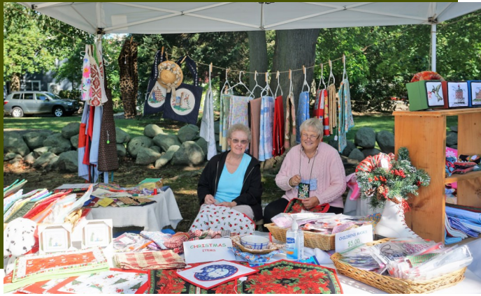
Vendors at the annual Artisan Market