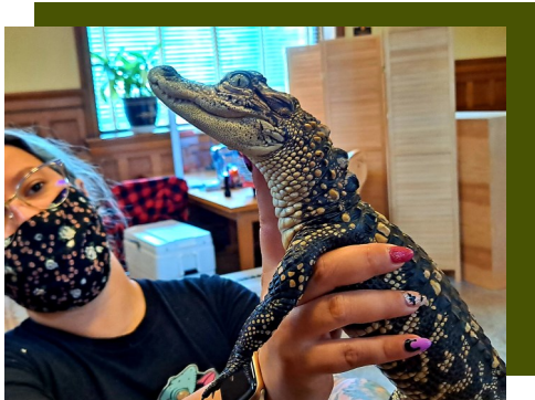
A toothy visitor from our Riverside Reptiles program