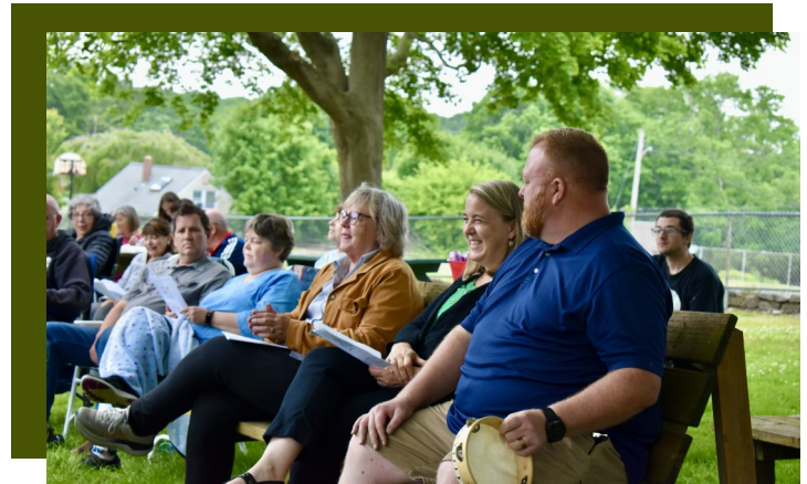
Dozens of enthusiastic Fab Four fans participated in our Adult Beatles Sing-Along on Make Music Day!