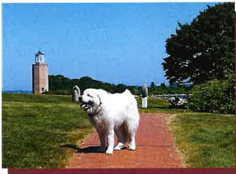
A fun part of Summer Reading was our Where's Clancy? Challenge.