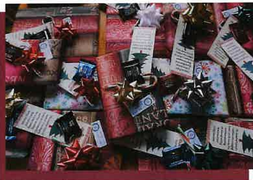
Celebrating Jolabokaflod with our patrons (R).