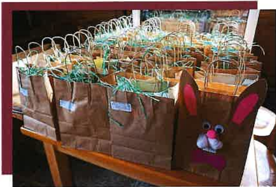
Throughout the year we created 12 different Take & Make activities and distributed a total of 466 bags or packets to our young patrons.