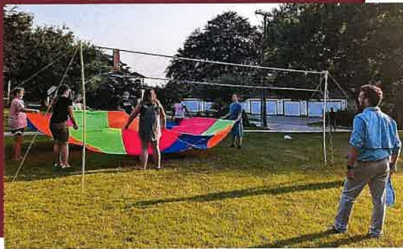
Teen Outdoor Game Tournament