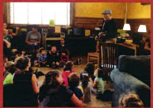
Make Music Day