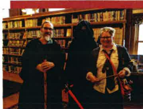
(R) Free Comic Book Day / Star Wars Day