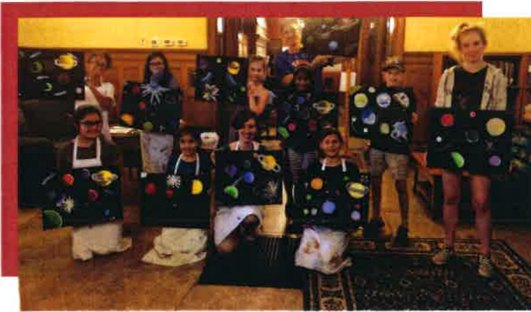
Intergalactic Painting Party!