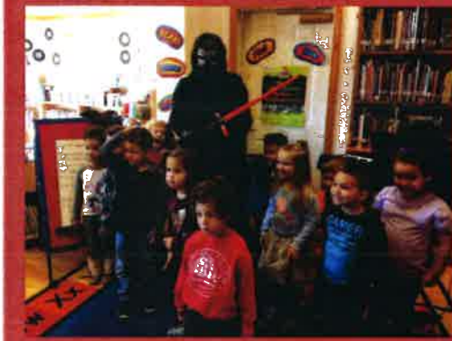
Star Wars Reads Day

Our weekly all-ages Story Time, which includes music and other interactive elements, is held throughout the year and is well-attended. We also held 15 popular special programs for children and families, many featuring live animals, live music, and Star Wars! We continued our partnership with The Riverfront Children's Center by hosting their classes for story times. Our 1000 Books Before Kindergarten program continues and saw several children complete this milestone.