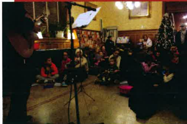
Festive carolers sang along to live music before meeting Santa Claus and enjoying cookies & hot cocoa.