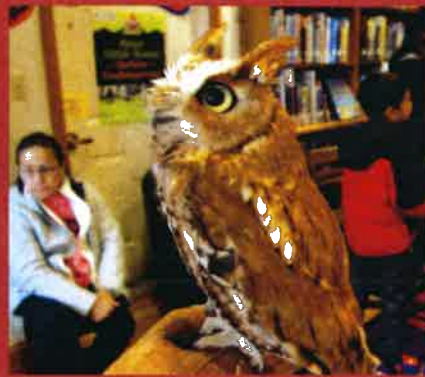
Denison Pequotsepos Nature Center