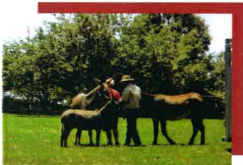
Donkeys from Tripledale Farm