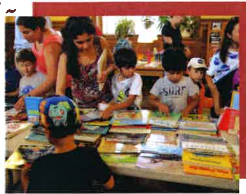
Summer readers choosing their free books

Donors sponsored 100 readers this summer!